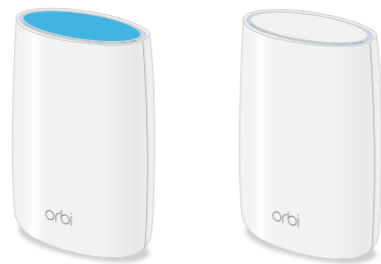
Orbi router (Model RBR50)